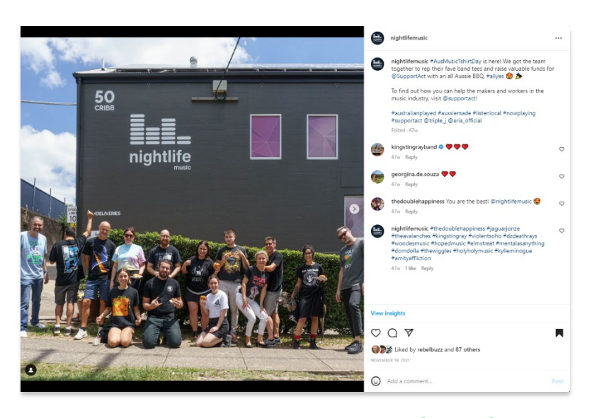
Nightlife Music's post for #ausmusictshirtday2021 [Instagram]

To learn more about Ausmusic T-shirt Day, visit the Support Act website here.