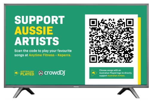
3. Digital signage with custom QR code generated by Nightlife

A digital signage slide with a custom QR code for your venue is available via the Advertising Library in the Manage My Nightlife web app.