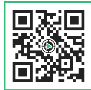
1. Download crowdDJ

Don't stop there, though! You're only halfway.