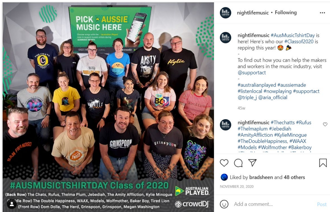
Nightlife Music's post for #ausmusicshirtday [Instagram]

To learn more about AusMusic T-shirt Day, visit the Support Act website here .